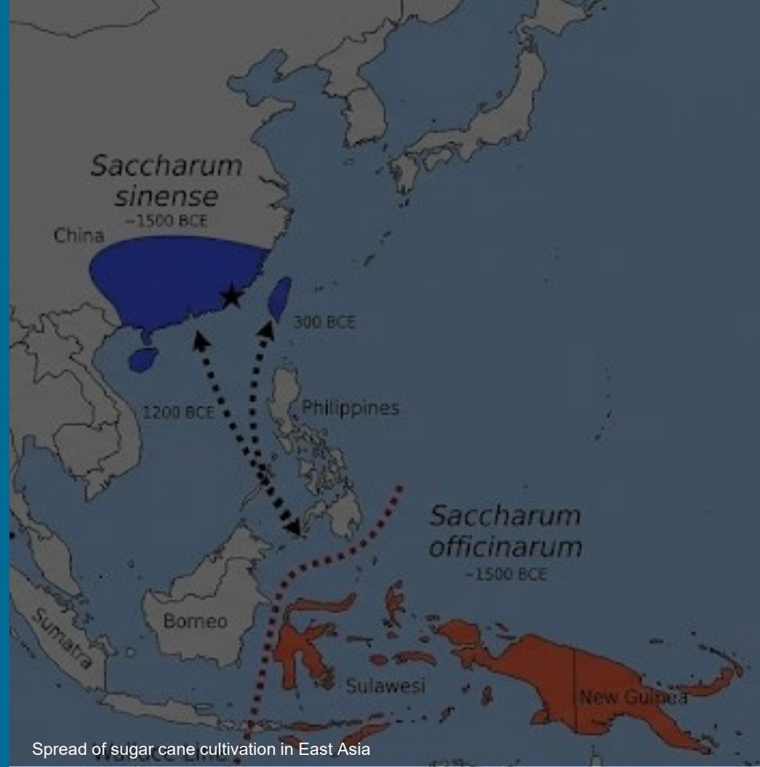
Spread of sugar cane cultivation in East Asia

Forced cultivation, monopoly, and the money trail to Kagoshima