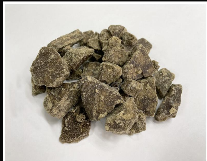
Amami kurozatō (Black Sugar)

Associate Professor in Modern and Contemporary Japanese History SOAS University of London